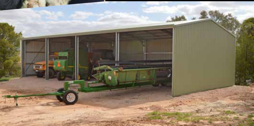
"Chook" knows the value of investing in modern egg production equipment to improve efficiency and he invested in this 9m x 18m x 3.9m GRANT machinery shed to protect his farming machinery and equipment from the ravages of our harsh Aussie summers.

As a primary producer who also markets their own product you've got to be able to roll with the punches and knock on some doors when the need arises.