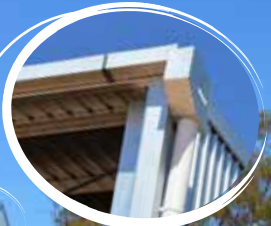
High Volume Gutters, Rainheads & Downpipes