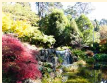
▲ Above: One of many private gardens open to the public in Mt Wilson