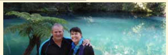
▲ Beautiful blue lake at the Jenolan Caves, Blue Mtns.