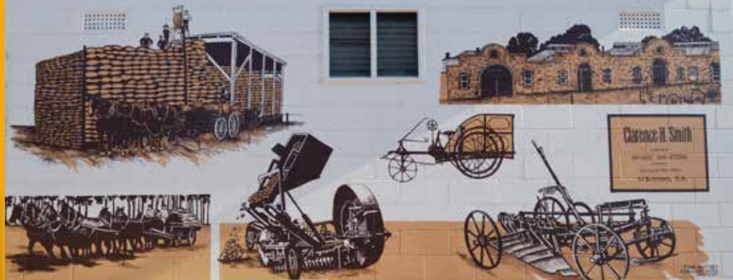
▲ Mural of history at Ardrossan. I know I'm getting "older" because these history items gain my attention.