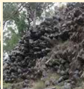
▲ We were fascinated to discover these basalt rocks unexpectedly as we drove over the ranges to Dubbo. They are similar to rocks we saw at 'The Giants Causeway' in Northern Ireland in 2014 (right), but horizontal instead of vertical.