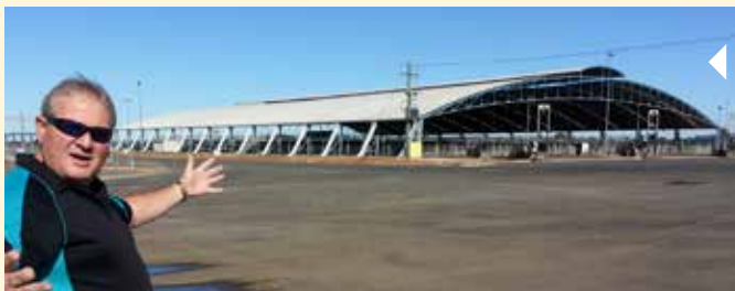
This massive structure is the Dubbo Livestock Exchange. Not one of ours but an interesting and enormous structure. A shame there were no sales on this day. We'd have enjoyed the hustle and bustle of a sale day.

So that's it for now, I hope you've enjoyed sharing a few of our Holiday Happy Snaps. Until Next time,