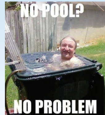
No Pool ... Make Do!