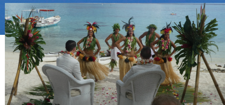
The grooms enjoy a Tahitian dance troupe to celebrate their marriage.

The wedding was a lot of fun with a Polynesian flavour.