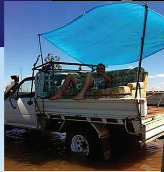
No Air Con ... Go Natural!