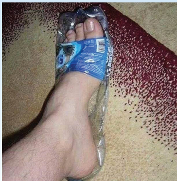
No Thongs ... Improvise!