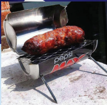
No Barbie... No Problem!