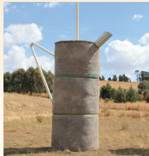
Machinery maintenance with an oil can