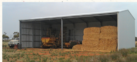
Hay sheds like this one above (Glen Farr, Wunkar) are included in the types of fodder storage sheds that can be depreciated over 3 years.

The information presented is general in nature and not to be used, relied or acted upon without seeking professional advice to ensure that the information is appropriate for your individual circumstances. William Buck accepts no liability for any errors or omissions, or for any loss or damage suffered as a result of any person acting without such advice.