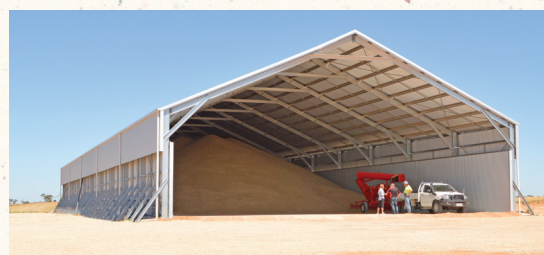
Grain sheds like this one (Andrew & Annette Cass, Loxton) are also included in the new tax rules. Smaller grain sheds are also available.