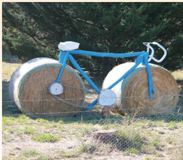
Cycling in the country