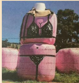
Sexy country gal