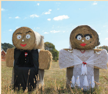
The romance of a country wedding!