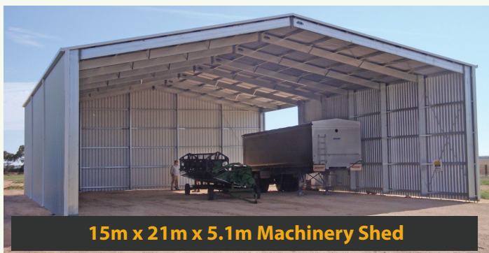
15m x 21m x 5.1m Machinery Shed