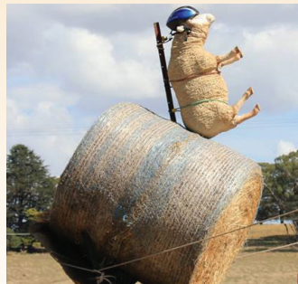
Delivering Sheep... The catapult method